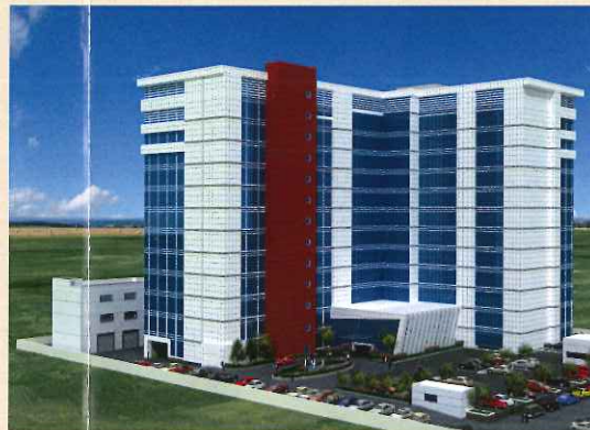
TICEL BIO PARK-II

Biotechnology Core Instrumentation Facility (BTCIF) established jointly by TICEL and Department of Biotechnology, Gol for providing scientific supports at a cost of Rs.193 millions.